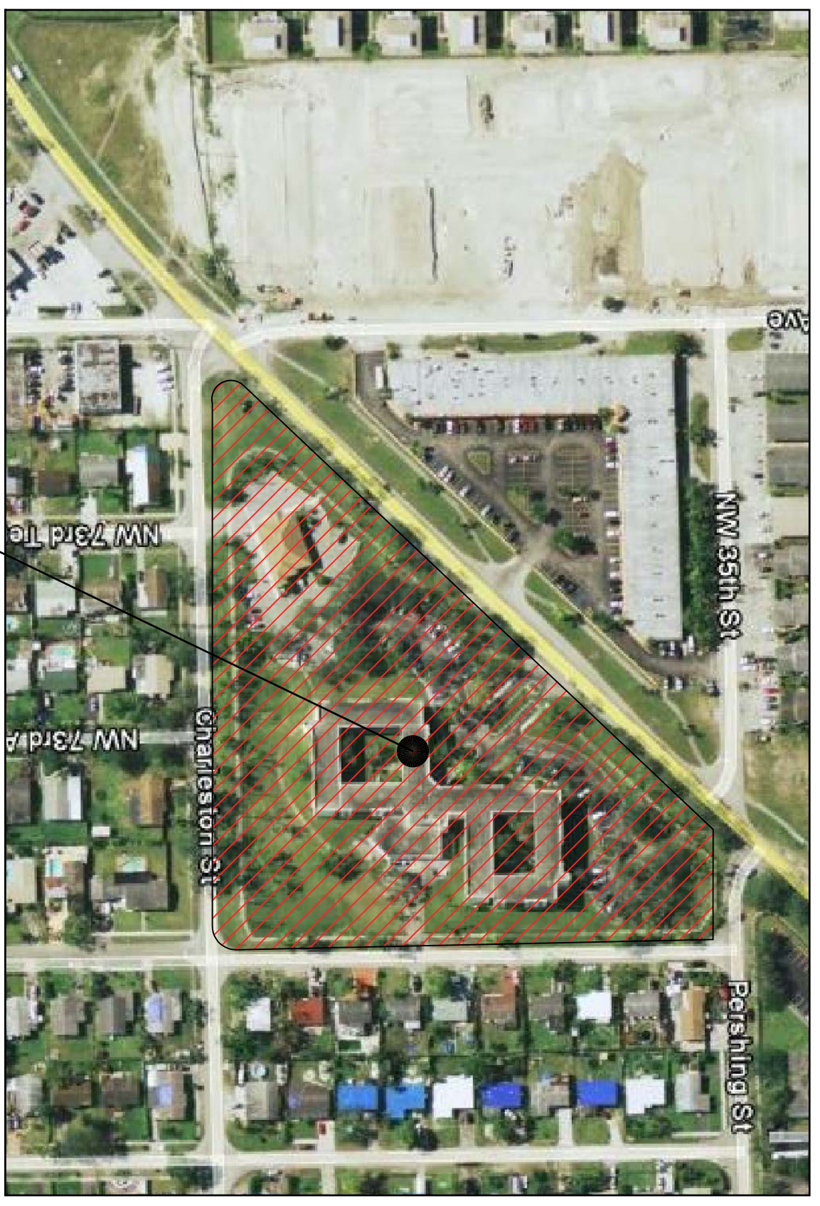
CONTEXT SITE PLAN SCALE: NTS