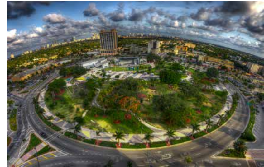
ArtsPark at Young Circle

The City hosts hundreds of programming hours with over 150 cultural programs including arts / dance, after-school, summer and adult learning programs, senior socials and so much more. There is always something to do here in the City of Hollywood's park system, so come out and play with us.